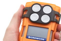
External filter plate Clip-on filter for dusty environments