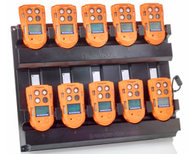
10 way charger For charging and storing your T4 fleet