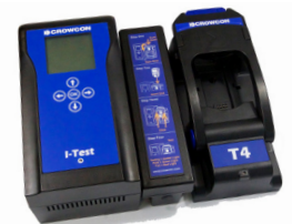
I-Test Easy automated bump testing and calibration solution