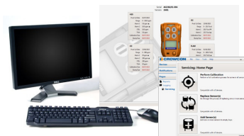
NEW Portables Pro 2.0 Software For easy configuration and servicing