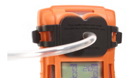
Bump/calibration plate To apply test gas to T4