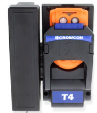
Vehicle charger Effective charging and storage whilst travelling