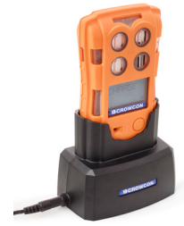
Cradle charger Docking station for easy charging