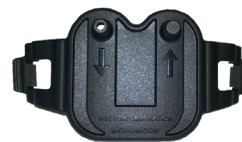
Aspirator plate Sample atmosphere prior to entry